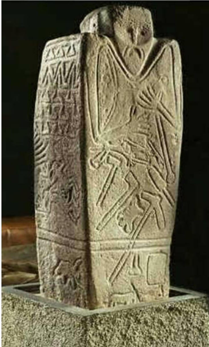
Kernosovsky's Idol: 3000-2500 b.c.

This revolutionary result of linguistics seemed to dictate the guidelines of archaeological research, to find evidence of this link, however the poor results were disappointing if compared to the enthusiastic expectations of the early days. In fact, archeology is generally unable to illuminate us on the ethnicity of the people who have left their traces. Linguistics, on the other hand, manages to define the origin of a word, a written text or toponymy, finding developmental links and ethnic relations, but cannot offer a link with the culture where the language was spoken and cannot provide a chronology.